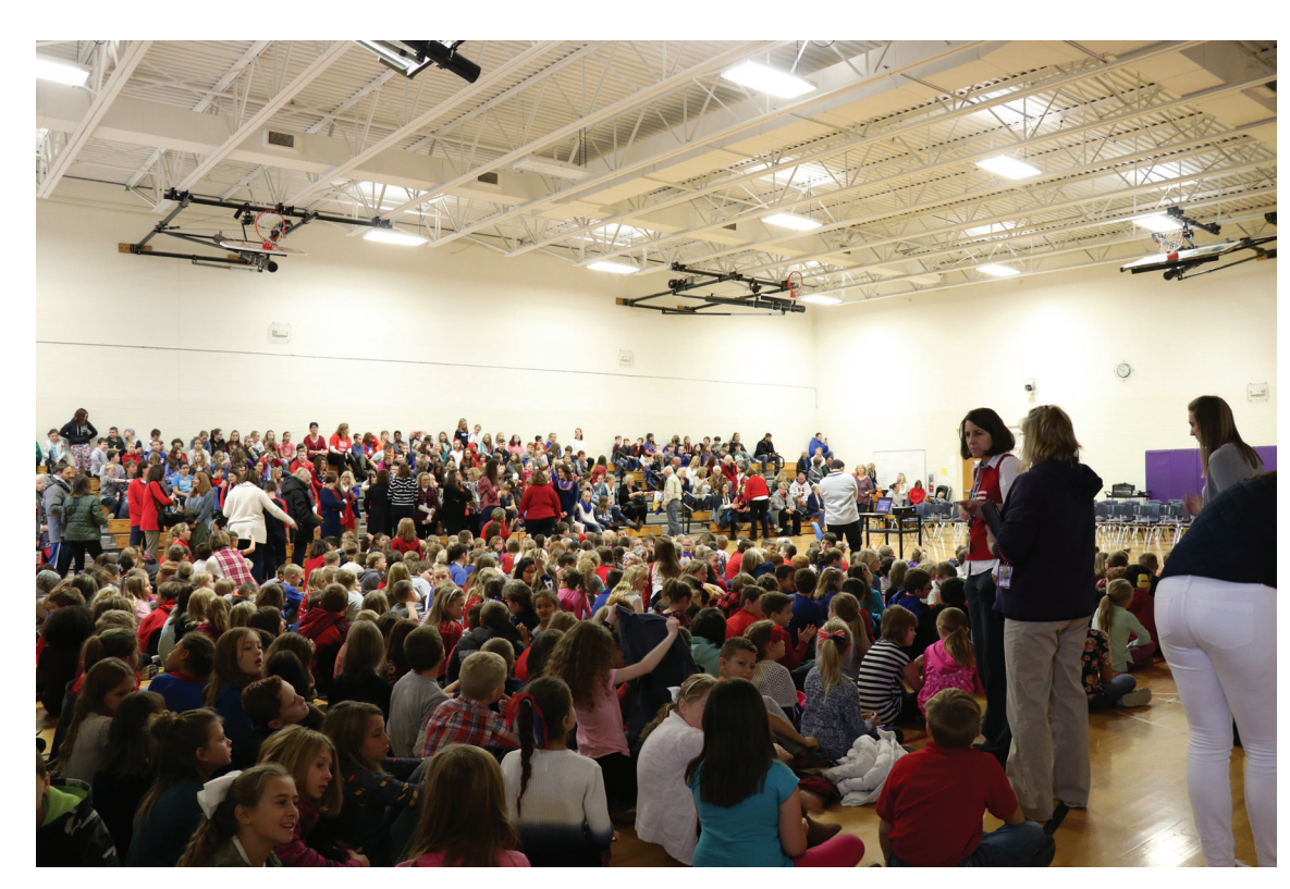
All Sherrard District Elementary students gathered at Matherville Intermediate to honor Veterans on Monday Nov. 12, in lieu of a day off.

Veterans were recognized a final time when the entire gym full of children, parents and teachers clapped in their honor.