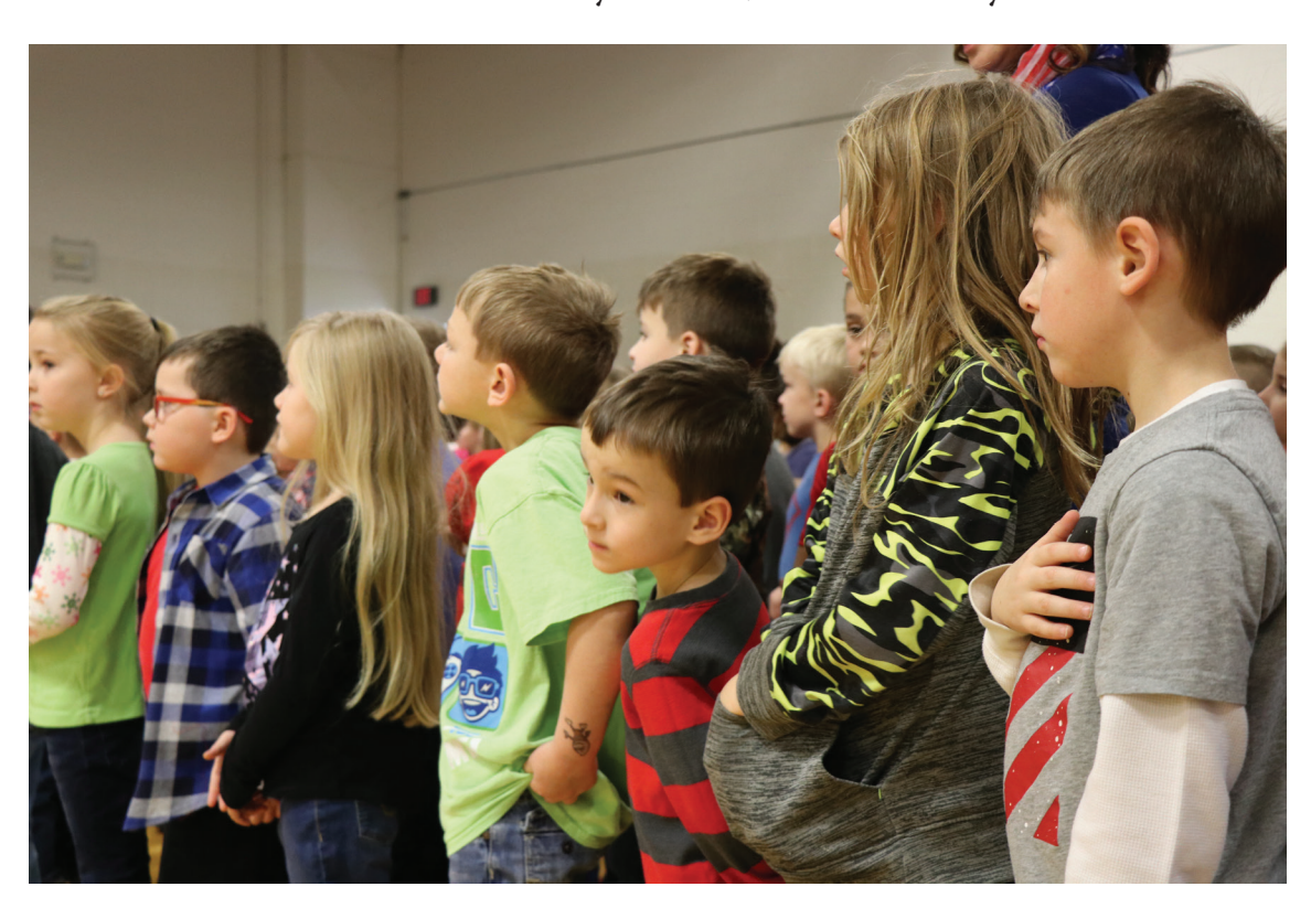
Above: Children stand to recite the Pledge of Allegiance as lead by the district Cub Scouts.

Below: Before the ceremony Cub Scouts prepare to march the flag into the gym.